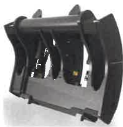
QUICK COUPLER, FUSION