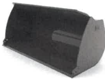
BUCKET, GP, 2.7YD3, FUS