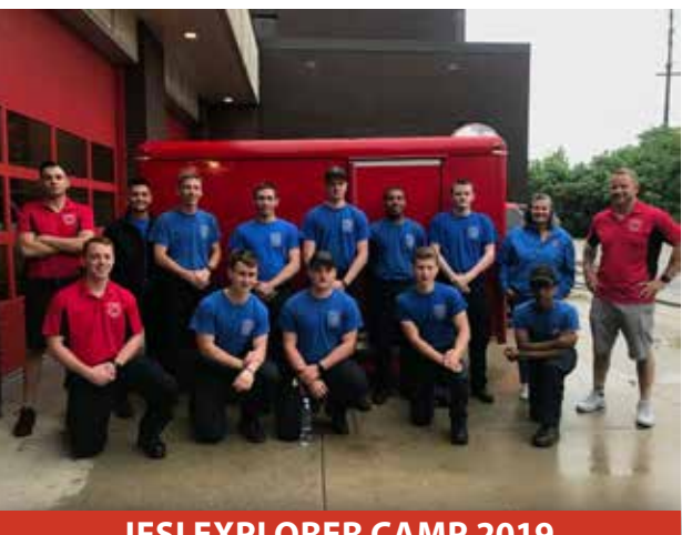
IFSI EXPLORER CAMP 2019

Please call 708-343-6124 ext 5, for information on our progressive program.